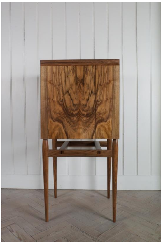
Whisky Cabinet (Walnut & Bog Oak)